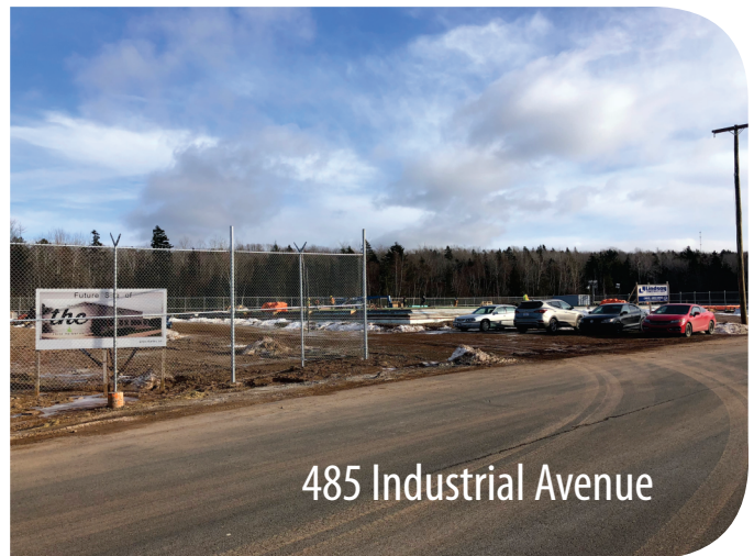
485 Industrial Avenue

Truro Herbal Company began construction in the Fall 2017 on a 6.3 acre parcel of land in the Truro Business Park. The company is building a 20,000 SF state-of-the-art agricultural facility.