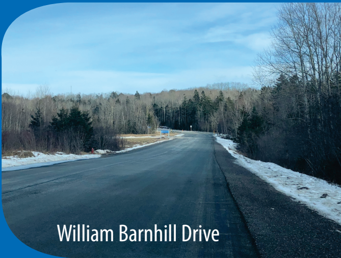
William Barnhill Drive

In the Fall 2017, crews also addressed drainage concerns, rebuilt the gravel base, and re-paved Upham Drive, between Willow Street and Polymer Road.