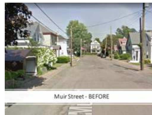
Muir Street - BEFORE