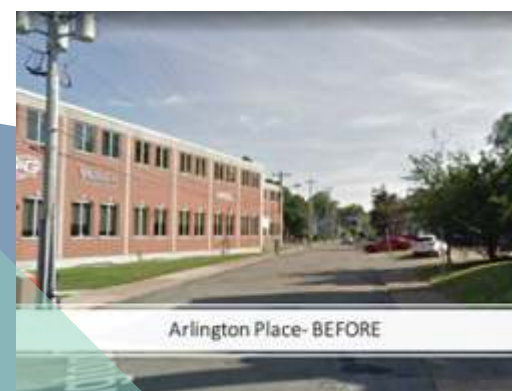
Arlington Place - BEFORE