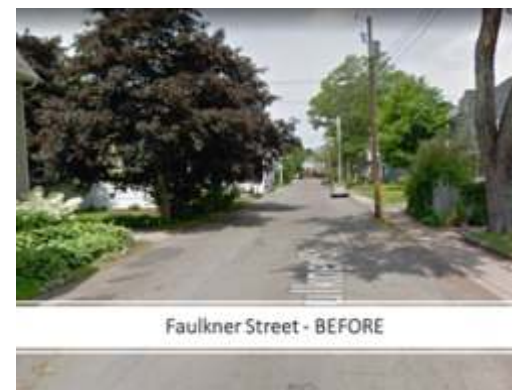
Faulkner Street - BEFORE

The street revitalization project included the rebuilding of over 800m of curb and gutter, 400m of sidewalk, and nearly 450m of street. In addition, traffic flow on Faulkner Street was converted to one-way northbound, and one-way westbound on Muir Street, east of Arlington Place. Total project budget was $458,000.