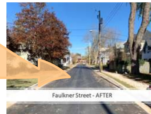
Faulkner Street - AFTER