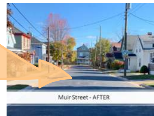
Muir Street - AFTER